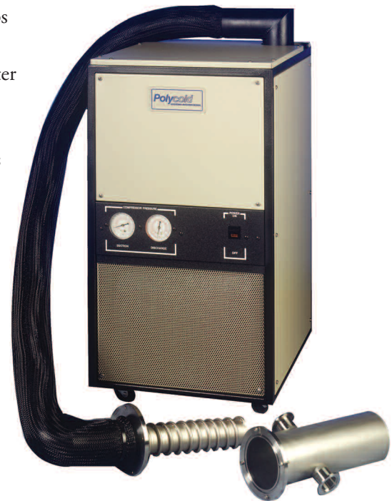
The P-100 with Cold Probe